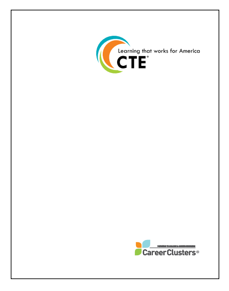
Figure 19. Fact sheet with CTE brand in the prominent position (emphasis on the brand) with Career Clusters in a secondary position.

It is important to provide adequate space for the CTE logo/signature to ensure the brand remains clearly distinguishable and uncluttered. As a rule, no other copy should be placed within a "brand letter" height of any portion the signature. (see Figure 21)