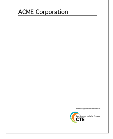
Figure 5. Sample letterhead showing relationship between corporate logo and CTE brand.