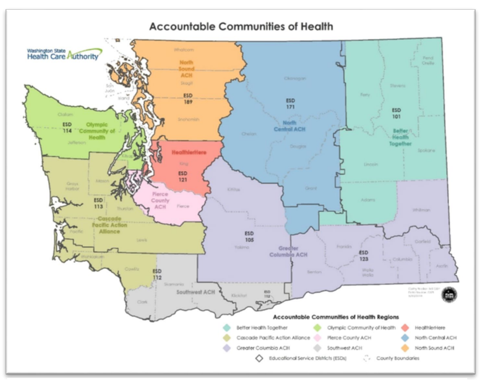
Figure 3: Regional ACHs and ESDs.

The Health Care Authority's (HCA) Healthier Washington initiative aims to build healthier communities through a collaborative regional approach involving the Accountable Communities of Health (ACH). The Healthier Washington approach includes goals that all people with physical and behavioral health comorbidities will receive high quality care and that