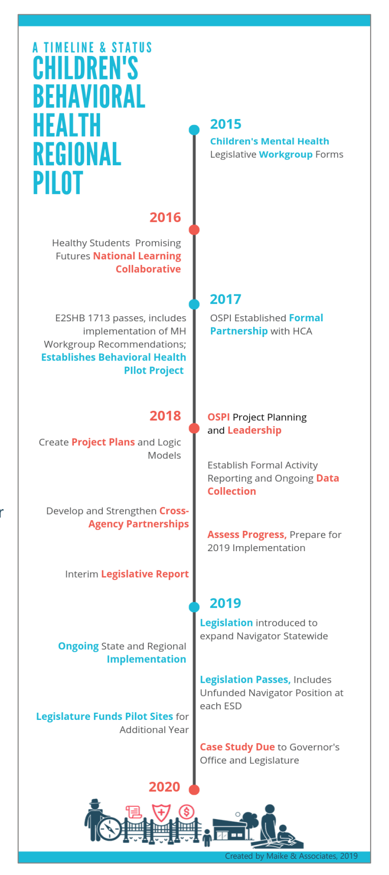
Figure 1: Pilot Timeline & Activities.

While conducting Medicaid coordination activities with districts, approximately half (53%) involved district administration, 14% with student support staff, 12% with finance staff, 8% with ESD staff, and 8% with special