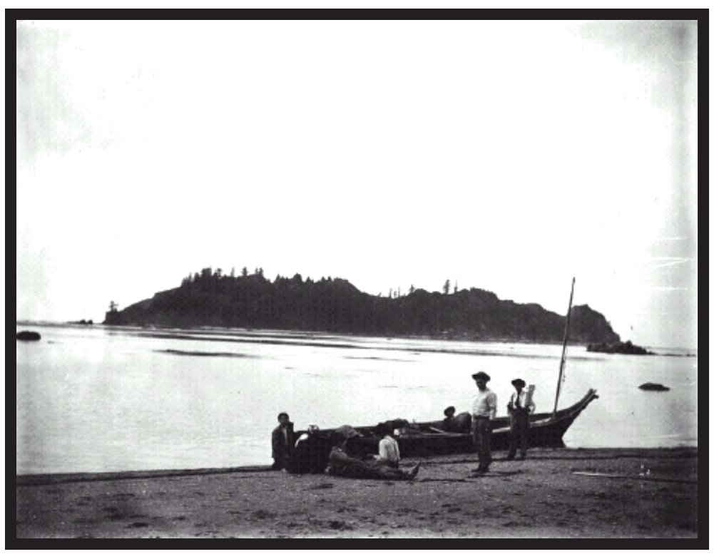
Makah group with canoe on beach at Cape Alava opposite Ozette Islands, Washington, ca.1903

A group of men, woman and children are on the beach in front of cedar canoe with mast. Ozette Island is in background. Negative Number: NA1072