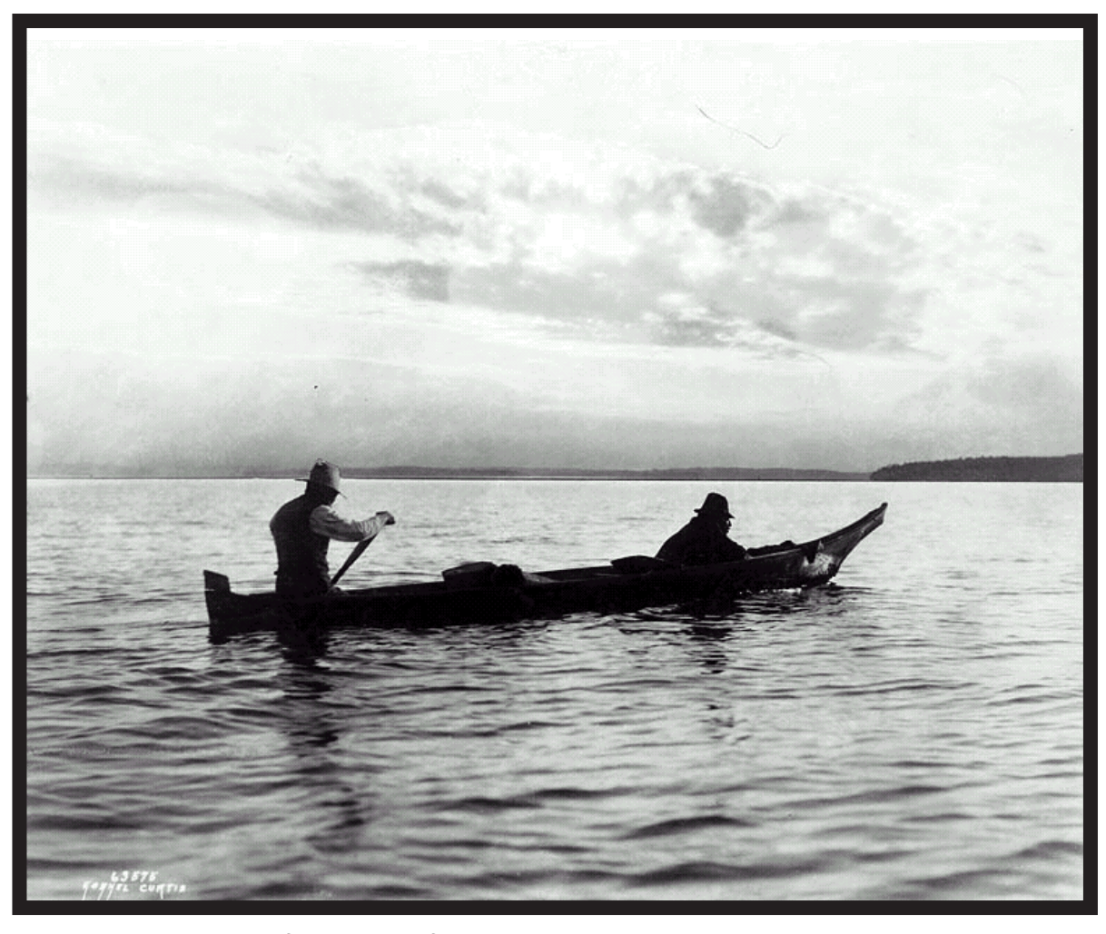
Lummi men trolling for salmon from canoe near Bellingham, Washington, ca. 1900

Man at rear of canoe paddles as the man in front bends over into the canoe. There is shoreline visible beyond them. Negative Number: NA689