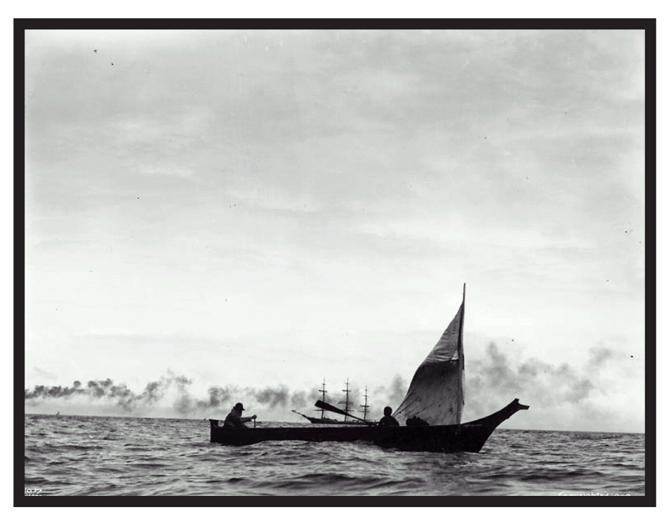
Makah sailing canoe, 1900

The Makah Indians built large ocean-going canoes which they used for whale hunting and for voyages around Puget Sound. By 1900, when this photo was taken, Makah canoes shared the waters with many large steamships and sailing craft. This photo, taken around 1900, shows two traditional vessels whose time is passing: a Makah sailing canoe and a large threemasted sailing ship. Negative Number: MOHAI 88.33.25