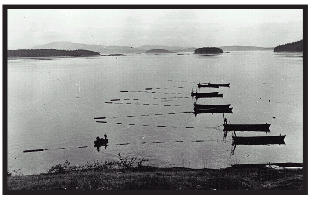
Lummi men casting nets from canoes in water, Washington, ca. 1940

Canoe racing has been part of native culture in the Puget Sound area for many generations. Here, at the Tulalip Indian Reservation, two-person teams compete in small dugouts. The traditional Coast Salish notched-prow style of canoe can be seen, along with the Nuu-chah-nulth, or Nootka, style of canoe, second from left. The former became extremely rare by the middle of the century, as the latter became more numerous. Negative Number: MOHAI 88.11.25