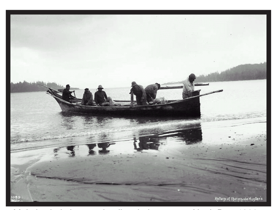
Makah whale hunters landing their canoe at Neah Bay, 1900

During his visit to Neah Bay in 1900, photographer Anders Wilse shot many pictures of the Makah's canoes. These carved cedar dugouts traveled miles out into the open ocean for whale hunting as well as for fishing and trading trips. Negative Number: MOHAI 88.33.122