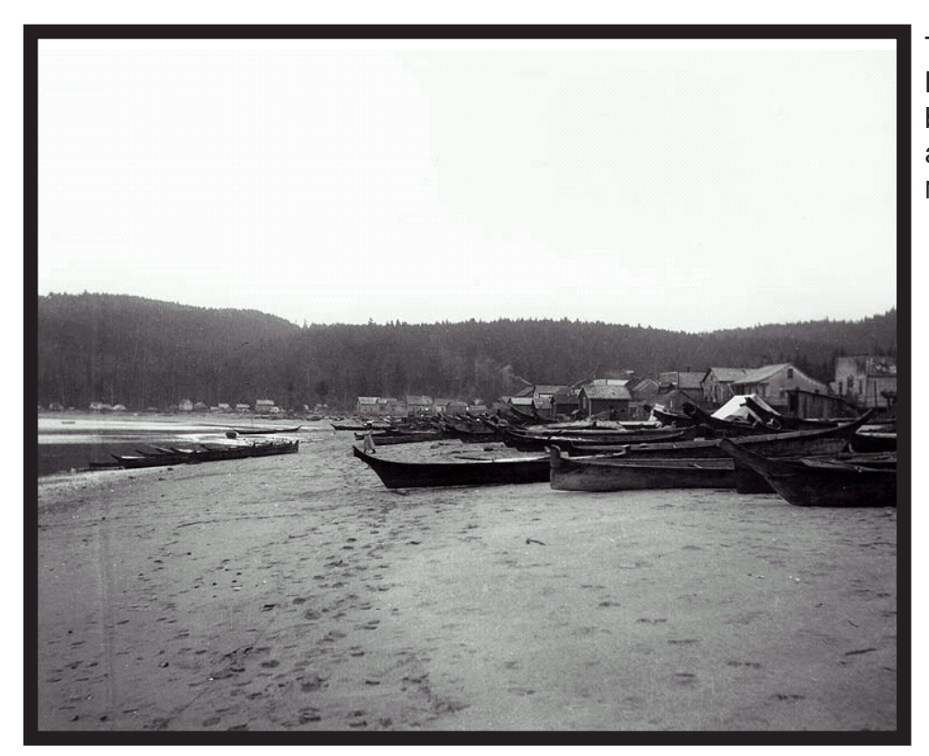
This is a long view looking north up the beach at many canoes and houses. Negative Number: NA1278