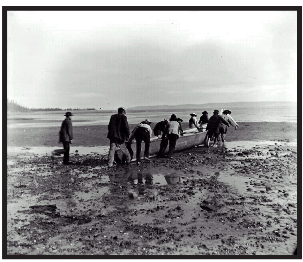
Indians launching their canoe at Port Townsend, August 30, 1899

A group of Indians is dragging a cedar dugout canoe towards the waters of Port Townsend Bay in late August 1899. In areas of frequent launchings and landings, the people cleared the beach rocks away, leaving open "canoe runs". These can still be seen on certain Olympic Peninsula beaches. Negative Number: Wilcox 5088