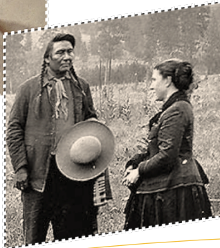
Chief Joseph and Alice Fletcher at the Nez Perce Reservation where Fletcher came to implement the Allotment Act.