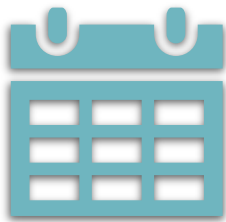
Timing of School Year