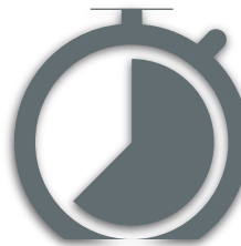
Length of Placement